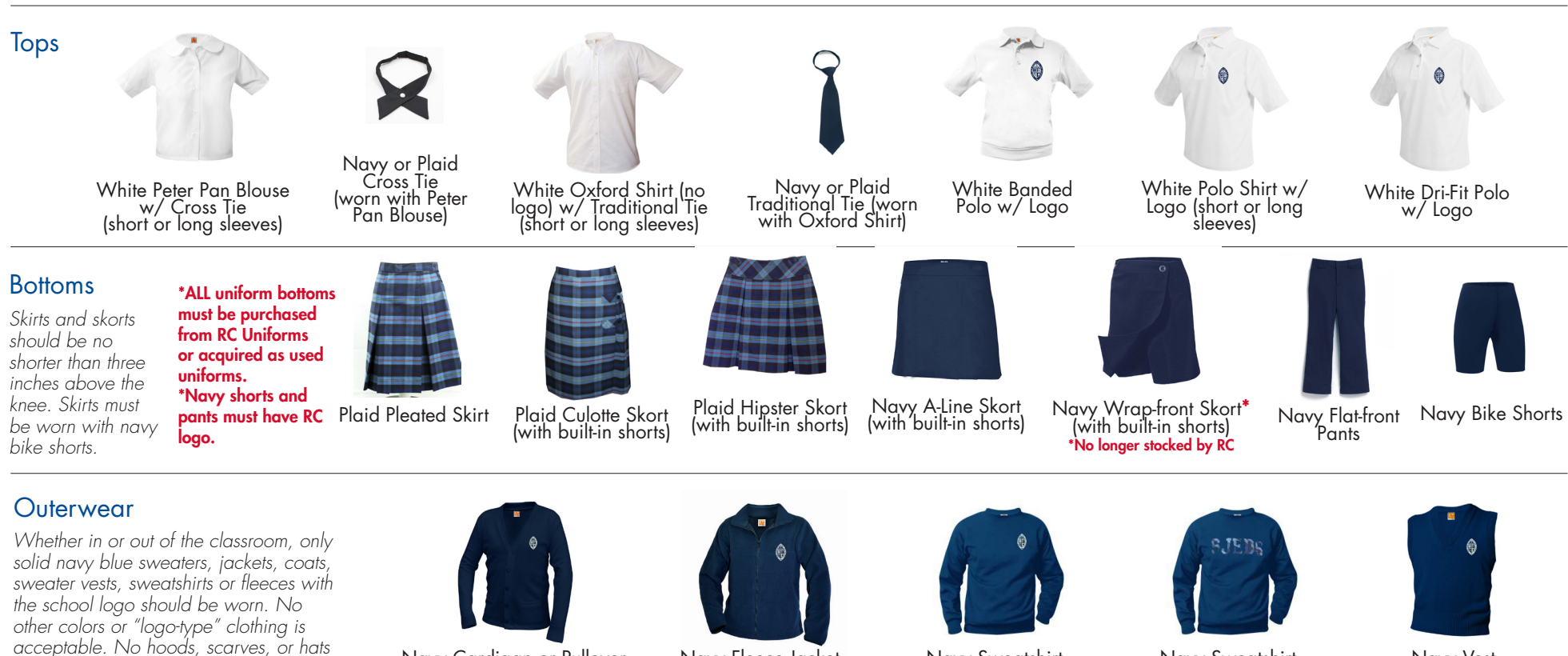
Navy Cardigan or Pullover Sweater w/ Logo