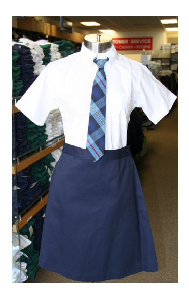
Please note: These are just a few possible combinations for your reference.