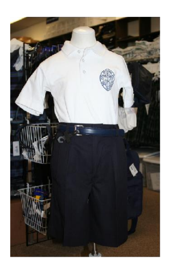
1st - 6th Grades: White oxford shirt, navy or plaid traditional or bow tie, navy shorts or pants, and belt

Pre-K4 - Kindergarten: White polo shirt w/ logo, navy shorts or pants, and belt