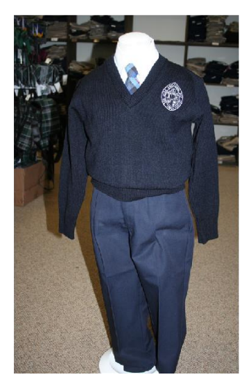
Please note: These are just a few possible combinations for your reference.