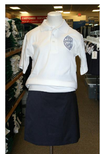
Please note: These are just a few possible combinations for your reference.